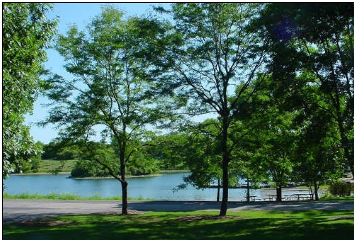
A beautiful August day for a retreat!