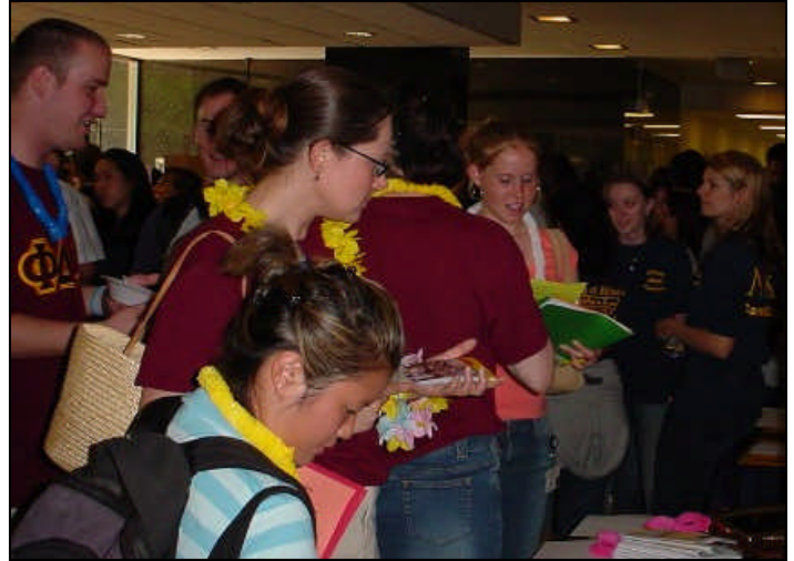
The chapter had a very successful day, which led to a pledge class of over 50 pledges!