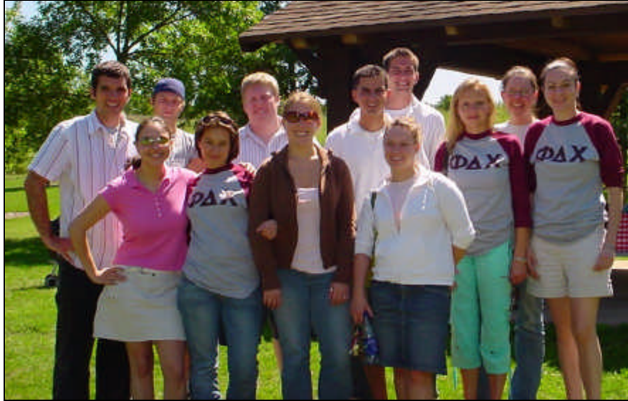
The Executive Board for the Collegiate Chapter 2005-5006.